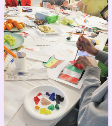
CAMHS Mural Project 2023