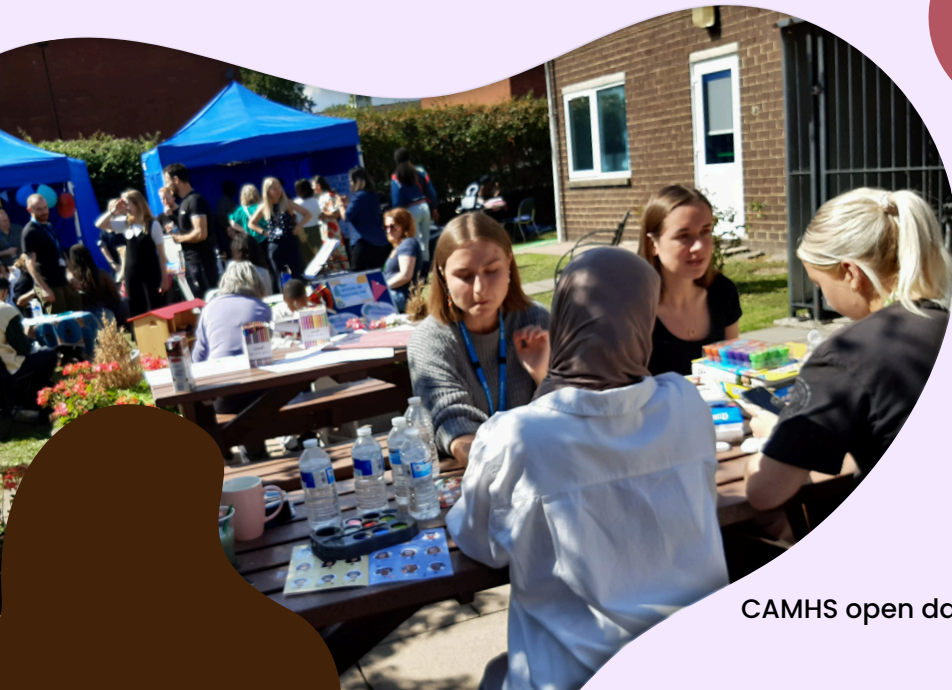
CAMHS open day 2023

Now more than ever CAMHS needs to work in partnership with young people to create services which anyone can access, which are well designed and make a difference.