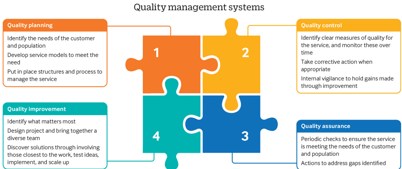
Fig 1 | The four aspects of a quality management system: planning, control, assurance, and improvement

Together, improvement, assurance, planning and control form the quality management system (fig 1).