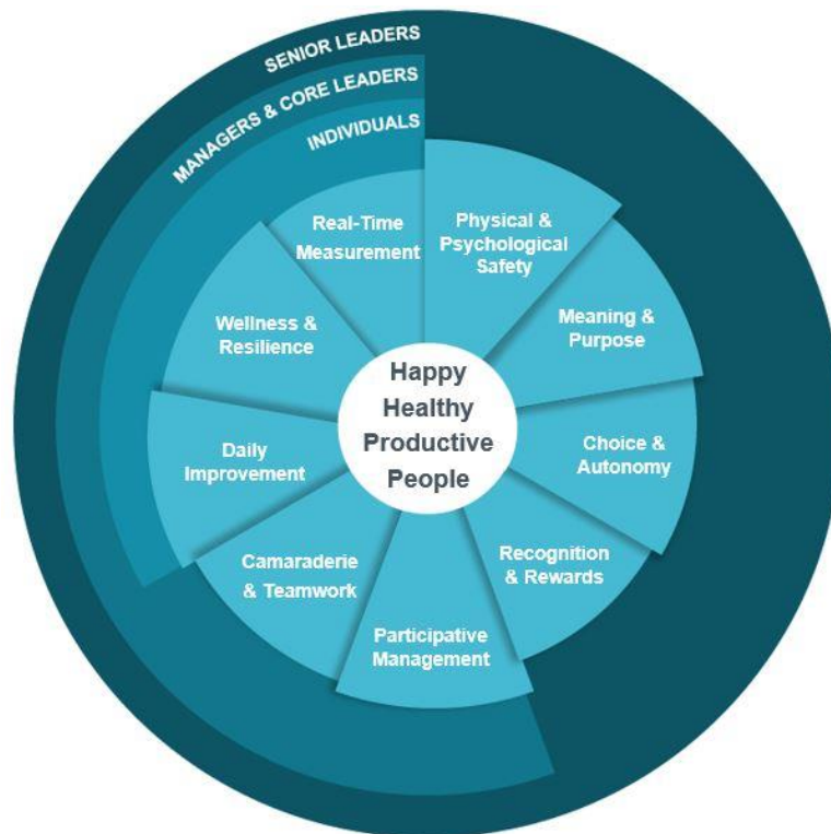
Figure 2. IHI Framework for Improving Joy in Work