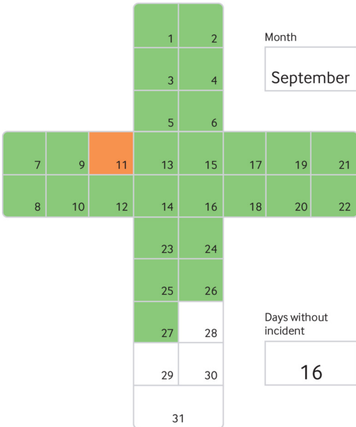
Fig 3 Example of a safety cross in use

BMJ: first published as 10.1136/bmj.l189 on 15 February 2019. Downloaded from http://www.bmj.com/ on 19 February 2019 by guest. Protected by copyright.